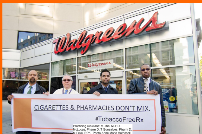
Practicing clinicians, TobaccoFreeRx.

The fine print: 1) By submitting your photo you acknowledge that it may be distributed, reproduced, and the world may see it (which is the point of this campaign). 2) We at TobaccoFreeRx acknowledge that your uploading of your photo/phrase in no way indicates endorsement by your school or college of pharmacy. 3) Cutting-edge, controversial, bold is OK. Inappropriate or unprofessional images will not be accepted. 4) The two $250 prizes will not both be awarded to students at the same school or college of pharmacy. Questions? Please contact us at: TobaccoFreeRx@gmail.com